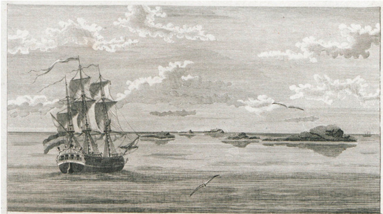
View of the Constable Rocks, off Cayenne, from N. E.